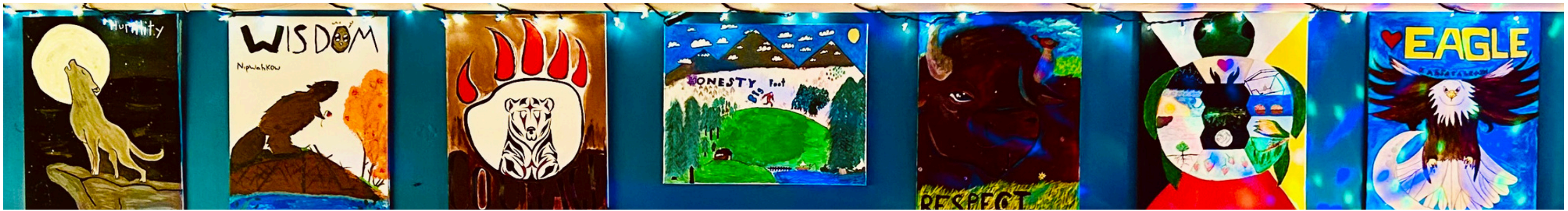
Art Work done by Lodge Leadership Youth & AFCC 2023

The Indigenous Learning Lodge at Forest Lawn High School invites you to become part of a vibrant Indigenous Youth community of belonging. Our Lodge is an inclusive and culturally safe space dedicated to supporting self-identified Indigenous youth to an improved school experience, well-being, and academic success.